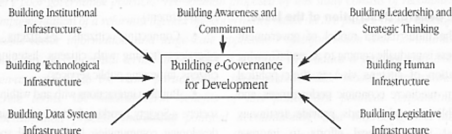
Fig 1: Strategic Framework for E-Governance initiatives 6

Participative notions of governance based on ICT strategies bring distinctly to the front the issue of public sector information . High levels of mismanagement, corruption and inefficiency have taken a great toll on the developing efforts of the transitional CEE countries and have thrown their public sectors into a deep crisis. Consequently, the new paradigm of public sector reform evolves now around five dimensions: increased efficiency, decentralization of the decision-making, increased accountability, improved resources management, and the use of market forces and partnerships with the private sector 7 . As a result, public sector information started to be more and more acknowledged as a